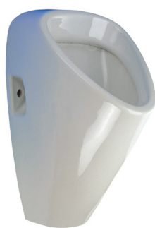
SLP 19 - GOLEM